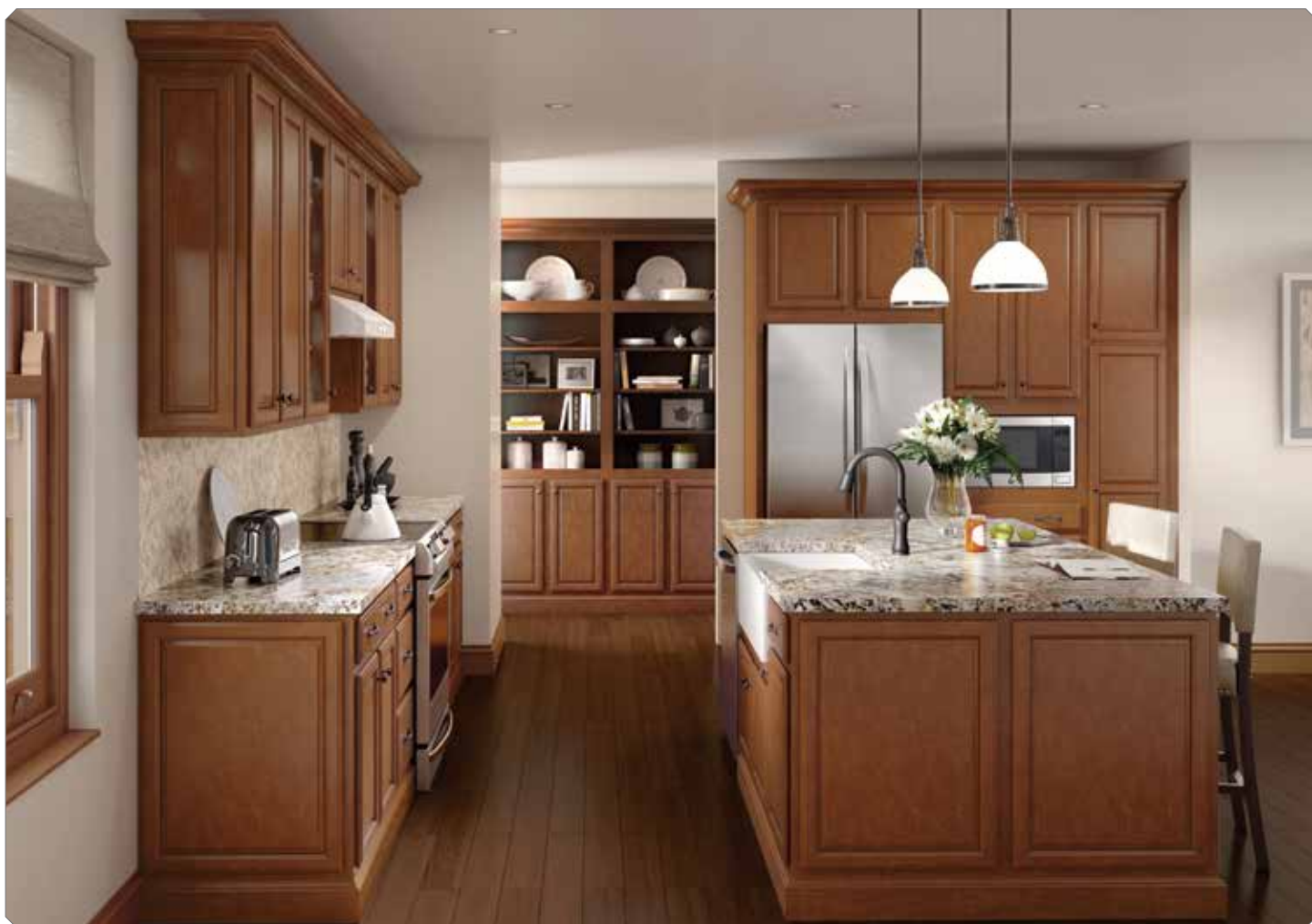
HARBORVIEW BIRCH IN CLOVE