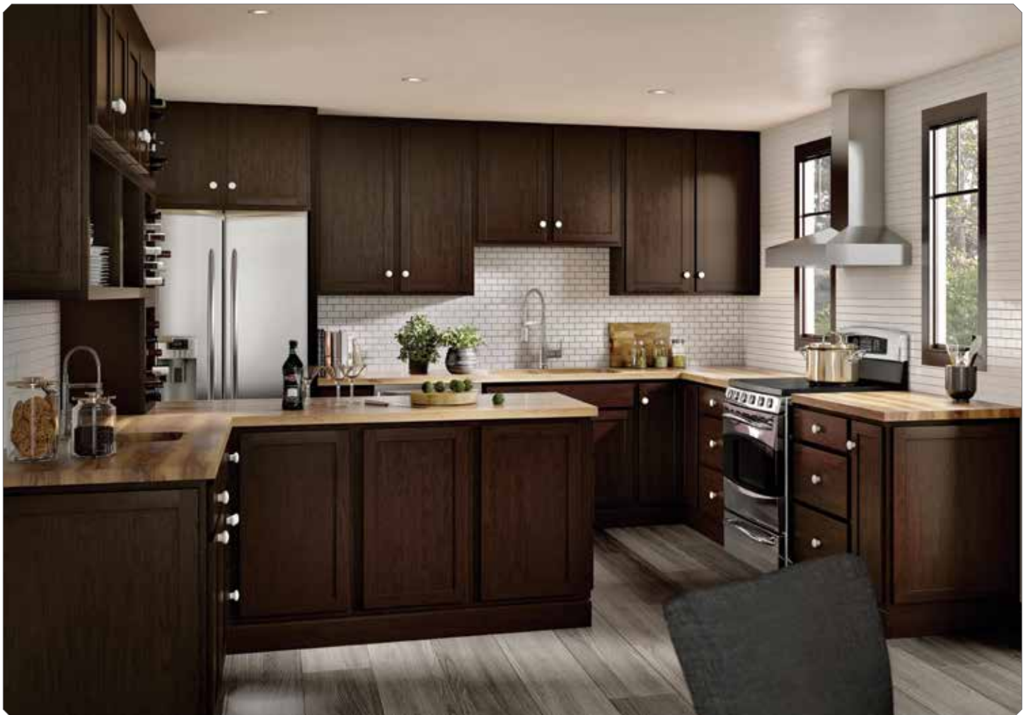
DERBY BIRCH IN TWILIGHT