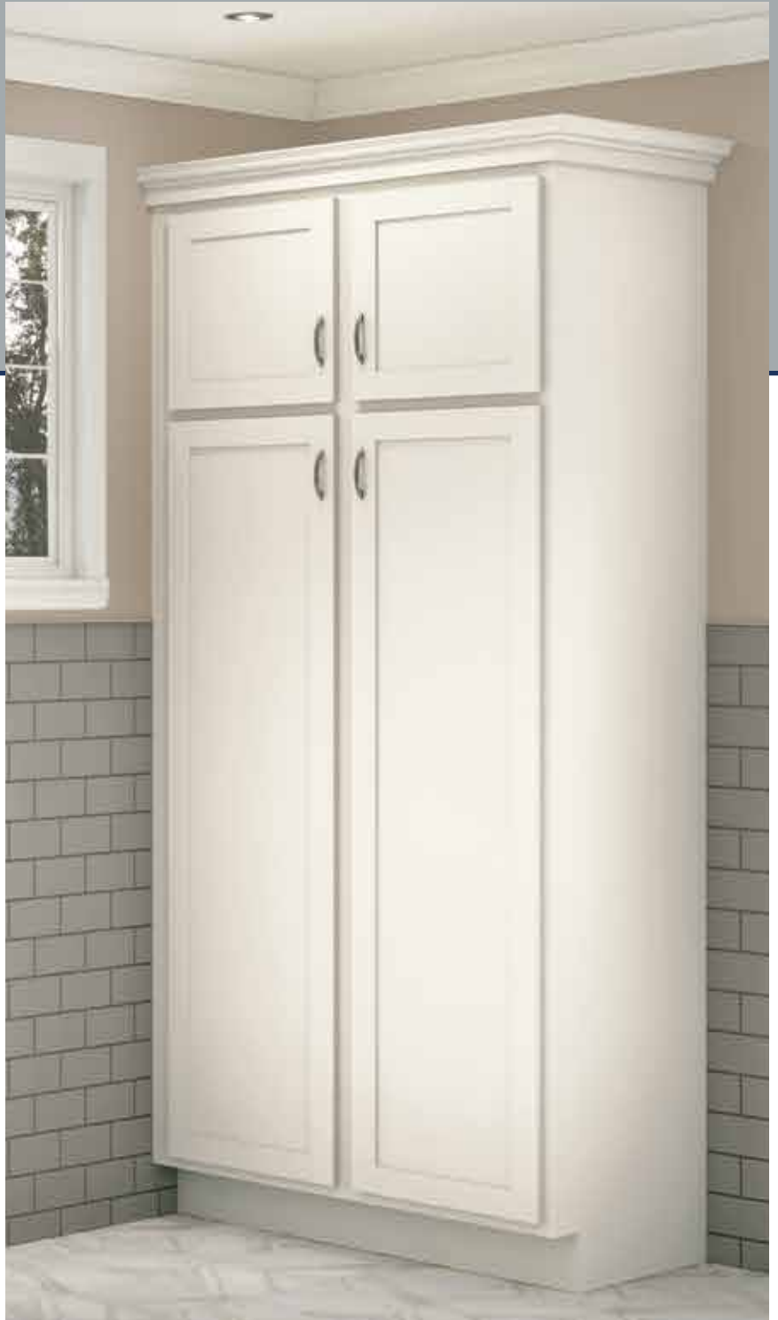
MADDIE LAMINATE IN WHITE