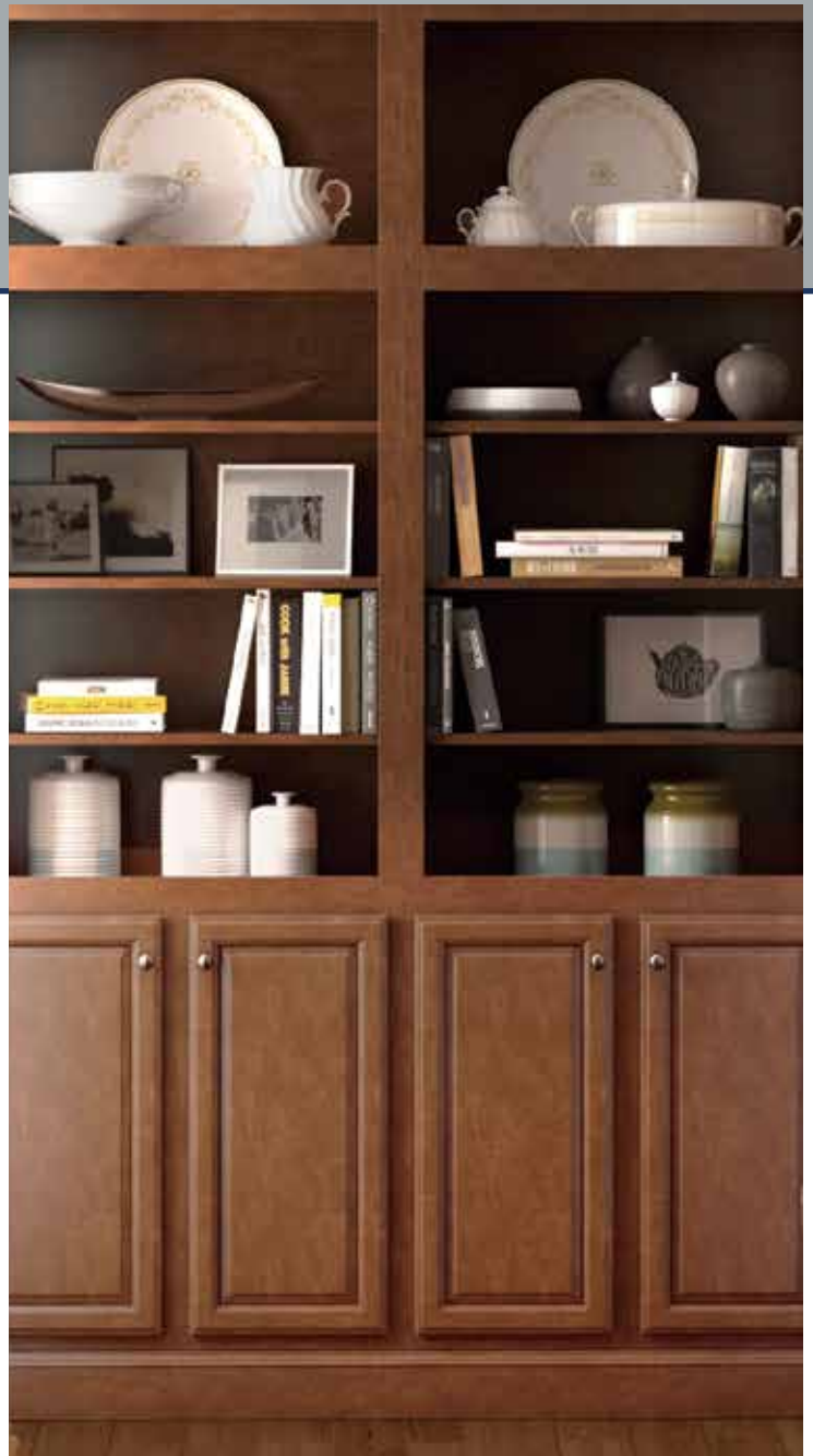
HARBORVIEW BIRCH IN CLOVE