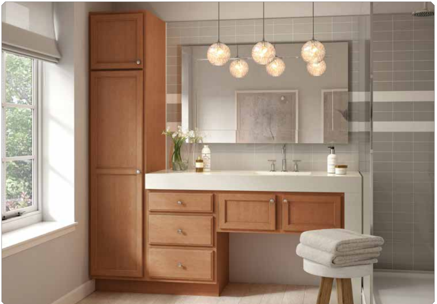
SEACREST BIRCH IN MIRAGE