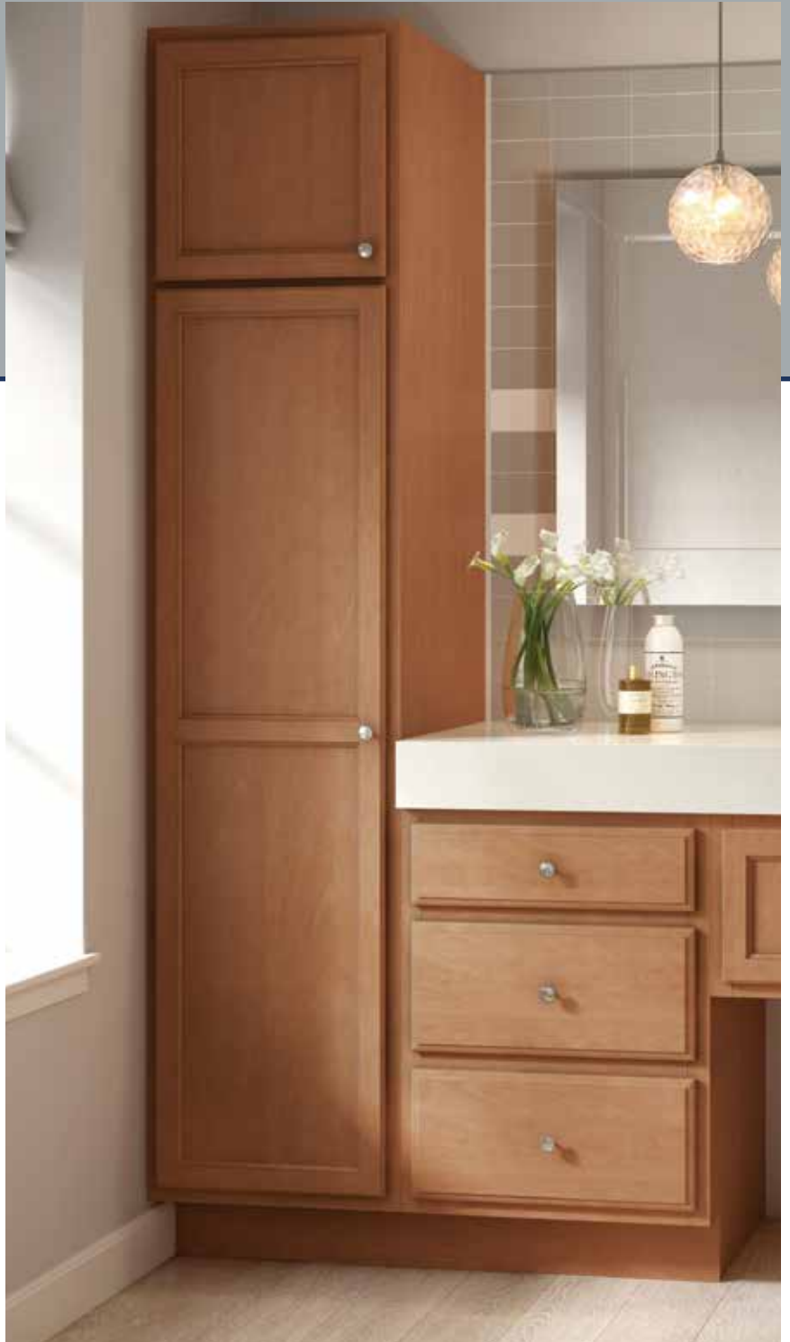
SEACREST BIRCH IN MIRAGE