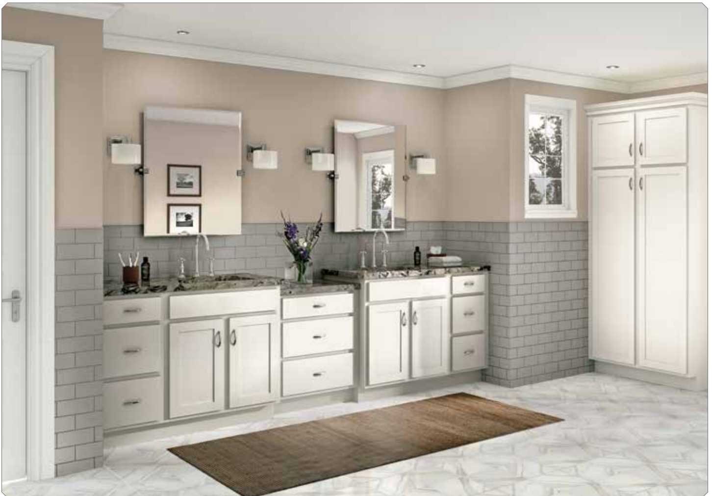
MADDIE LAMINATE IN WHITE